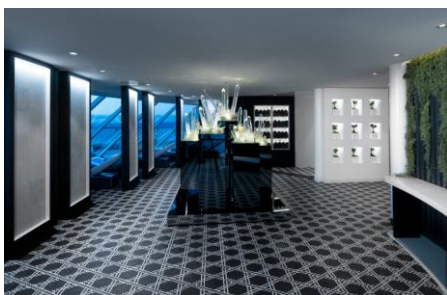
Thermal Spa 水療