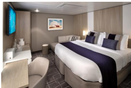
Inside Stateroom 內艙房