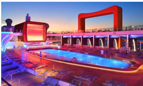
Resort Deck 泳池