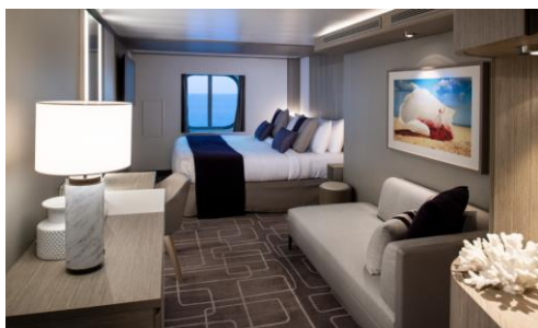
Ocean View Stateroom 海景房