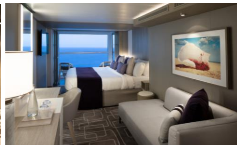
Infinite Veranda 露台房