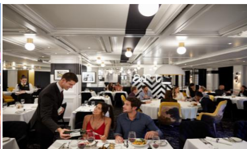
Main Dining Restaurant 主餐廳