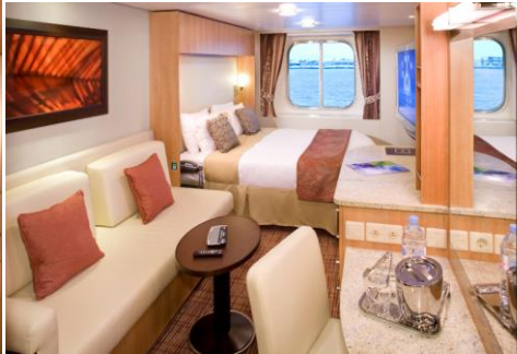
Oceanview Stateroom 海景房