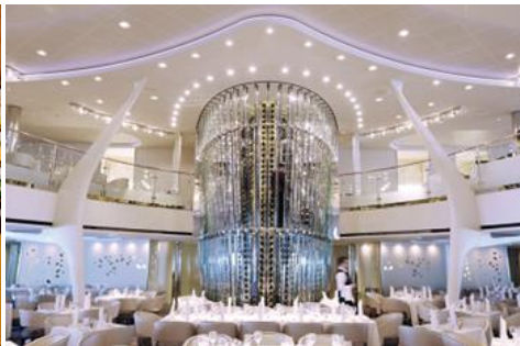
Main Dining Restaurant 主餐廳