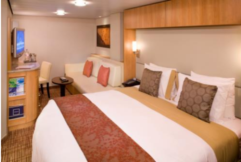
Inside Stateroom 內艙房