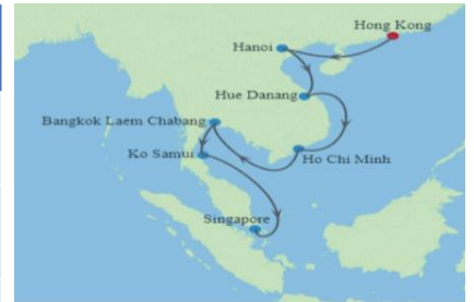
Sailing Itinerary 航程