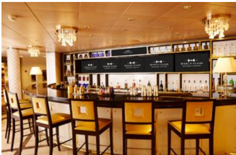
World Class Bar 世界級酒吧