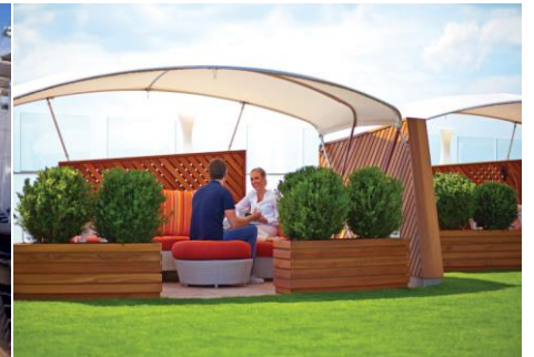
Lawn Club 真草綠茵俱樂部