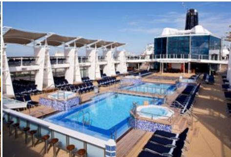
Pool Deck 泳池甲板