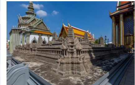
Bangkok Thailand 曼谷, 泰國