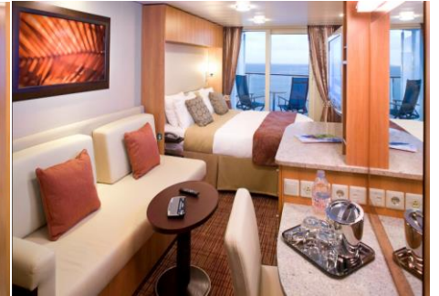
Veranda Stateroom 海景露台房