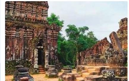
Hue, Danang, Vietnam 順化, 峴港, 越南