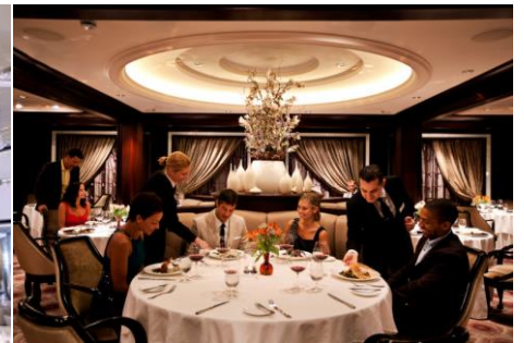
Special Dining Restaurant 特色餐廳